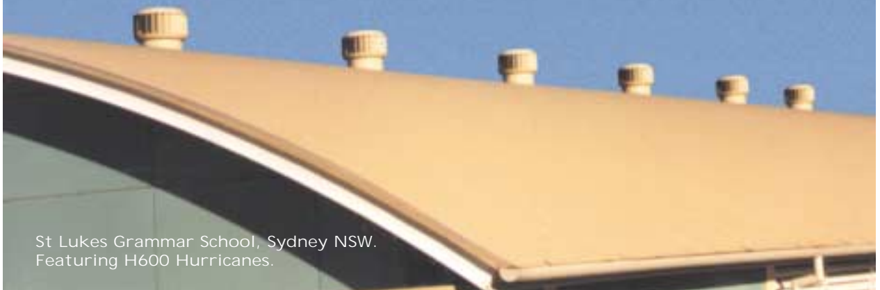
St Lukes Grammar School, Sydney NSW. Featuring H600 Hurricanes.

Despite the scientifically proven benefits of natural ventilation, many buildings do not have adequate fresh air exchange facilities in place. Stale and hot air will not disperse by itself. Opening doors and windows is simply not sufficient to create air flow. Air must be purposely removed and replaced by fresh, ambient air.