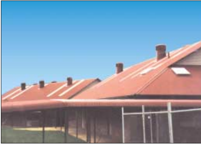
TERRA SANCTA COLLEGE, SYDNEY NSW. Featuring H700 and H900 Hurricanes.