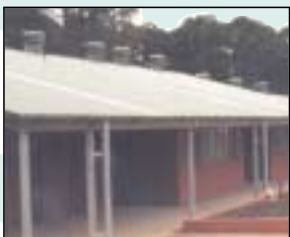
Cranebrook Public School