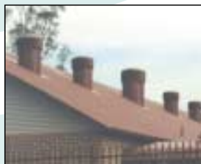
Terra Sancta College