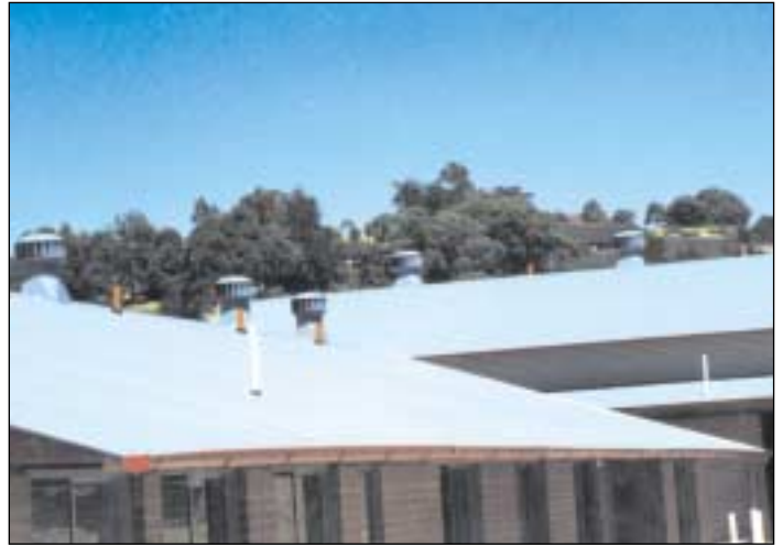
CORDEAUX HEIGHTS PUBLIC SCHOOL, SYDNEY NSW. Featuring H400 Hurricanes.