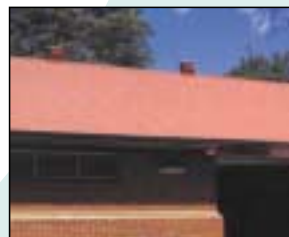
Roseville Primary School

Successfully removing the heat from over 200 Australian schools