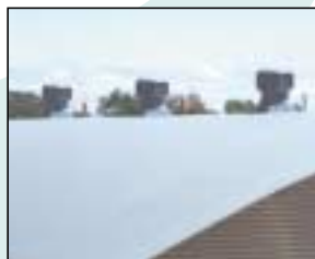
Cordeaux Heights Public School